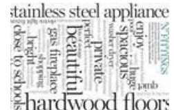
The language of selling houses